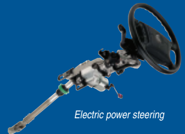
Electric power steering