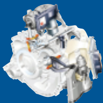
Robotized gear boxes