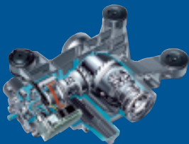
Torque case transfer