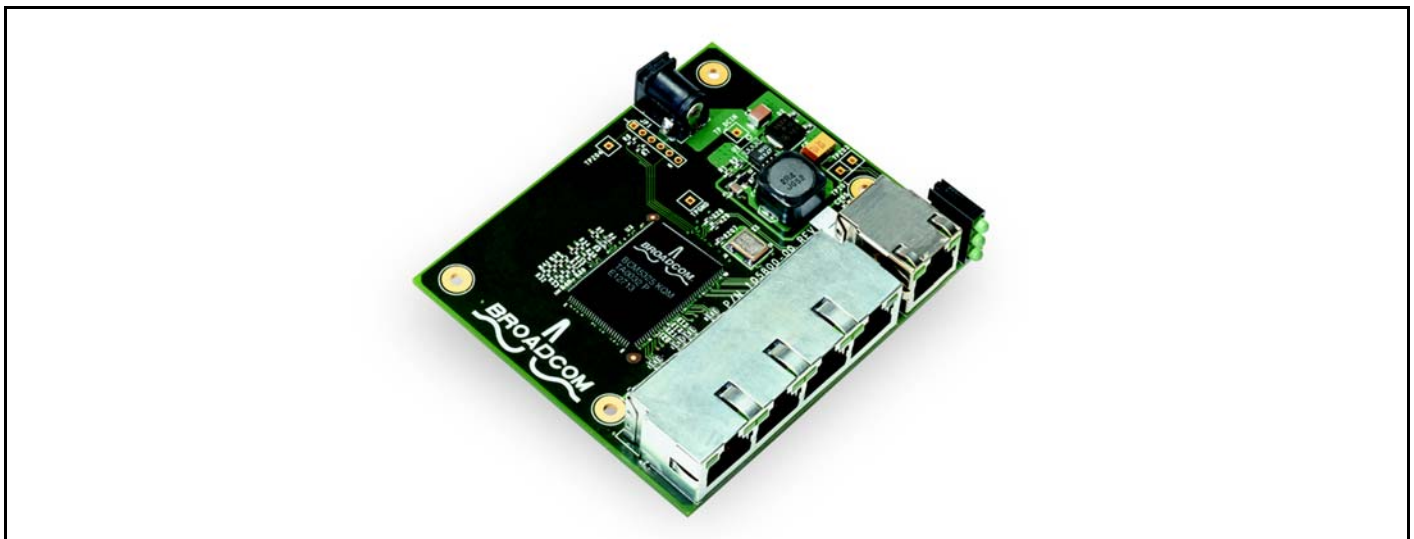
Low Cost Five-Port 10/100 Stand-alone Switch